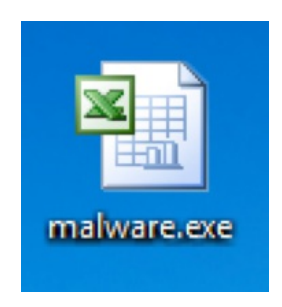
Figure 1 Microsoft Excel icon used by Aveo malware

The Aveo malware sample disguises itself as a Microsoft Excel document, as the icon below demonstrates. Note that the filename of 'malware.exe' is simply a placeholder, as the original filename is unknown.