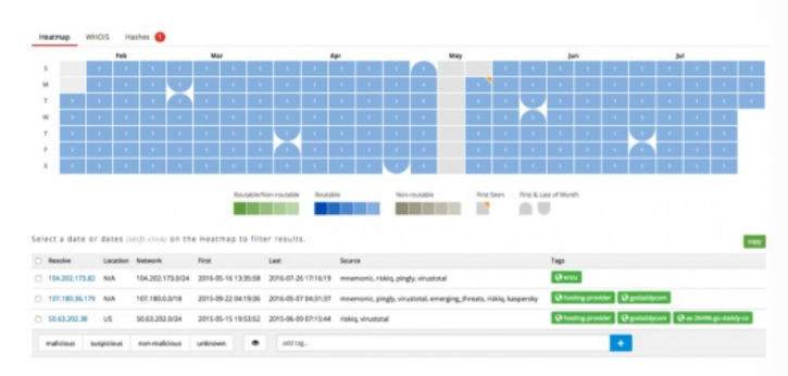
Figure 3 PassiveTotal screenshot showing associated IP addresses with snoozetime[.]info

All IP addresses in question are located within the United States.