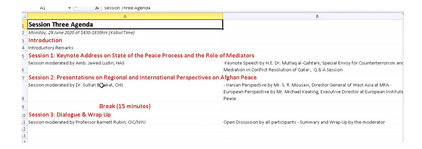
Figure 10: Maldoc impersonating the agenda for HAS' dialogue series 2020.