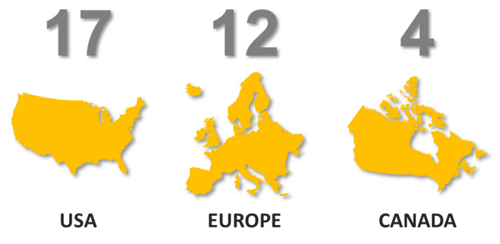
Figure 2. Three regions most heavily targeted by Butterfly attackers