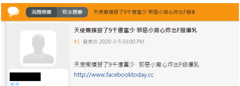
Figure 2. List of news topics posted by the campaign