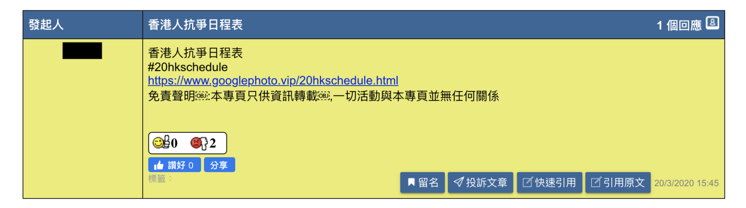
Figure 5. Link to malicious site claiming to be a schedule

These attacks continued into March 20, with forum posts that supposedly linked to a schedule for protests in Hong Kong. The link would instead lead to the same infection chain as in the earlier cases.