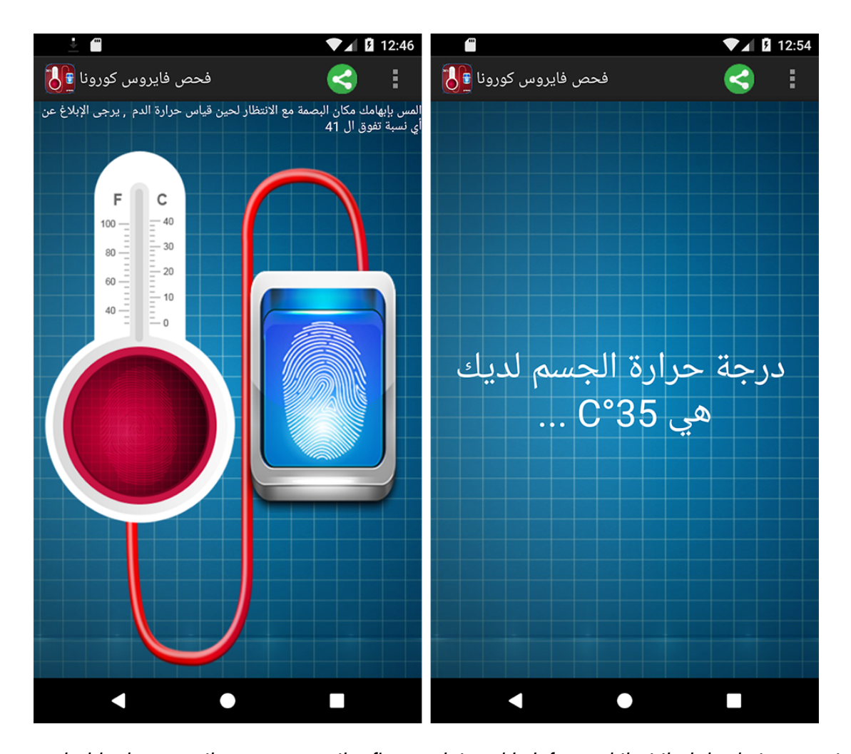
The user holds down on the screen on the fingerprint and is informed that their body temperature is 35°C.

Some AndoServer samples are purely surveillanceware that do not even pretend to be anything else, while others, like this sample here, contain legitimate applications inside the malware, with the benign APK hidden in the res/raw folder.