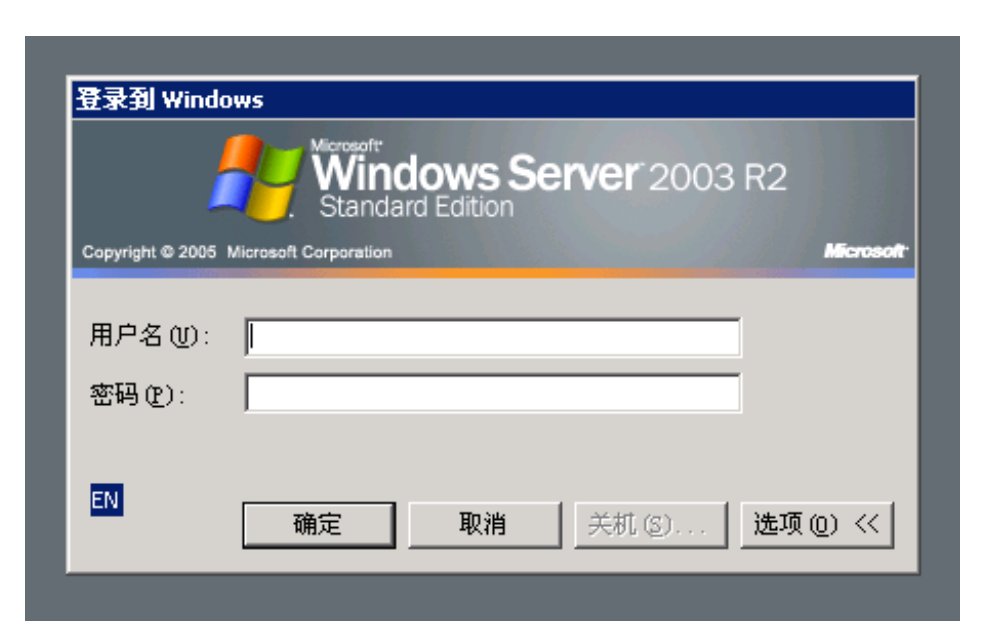
Figure 2. Chinese language Windows Server 2003 login banner on Gh0st C2

The infrastructure used in Musical Chairs stands out primarily due to its longevity and use of multiple Gh0st command servers on the same host. At the center of the infrastructure for the last two years is a Windows 2003 server using the IP address 98.126.67.114. The server uses a US-based IP address, but displays a Chinese language interface for Remote Desktop connections.