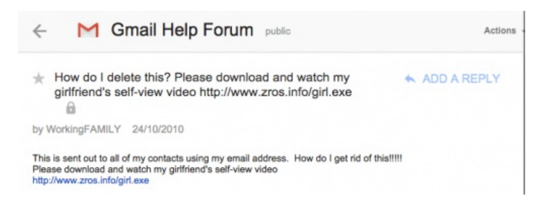
Figure 6. Screenshot of request on Gmail help forums related to "self-view" video e-mails.

Finally, we located a user who posted to the Gmail Help forum in 2010 requesting assistance with ridding their system of malware. He states that all of his contacts received one of the "self-view" phishing e-mails after his system was compromised.