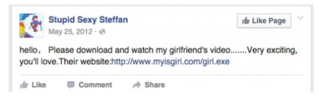
Figure 5. Screenshot of Facebook posting including a different "video" theme.

to a URL that is also part of the same infrastructure map.