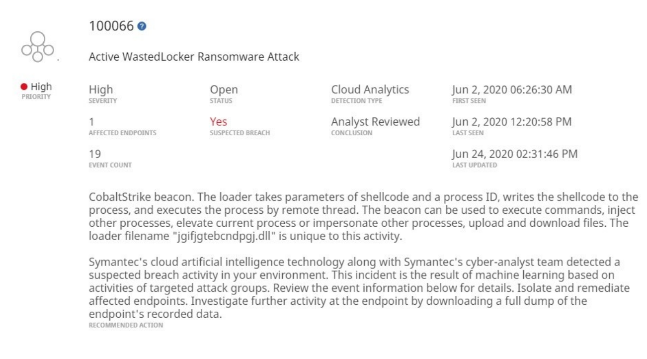
Figure 1. Example of Targeted Attack Cloud Analytics alert received by Symantec Endpoint Detection and Response (EDR) customers, warning them of early stage WastedLocker activity on their networks

This discovery enabled us to identify further organizations that had been targeted by WastedLocker and identify additional tools, tactics, and procedures used by the attackers, helping us to strengthen our protection against every stage of the attack.