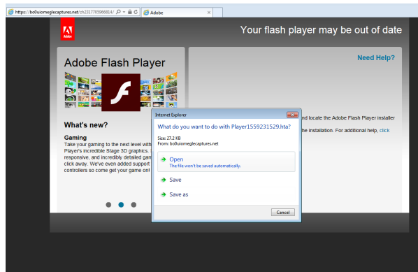
Figure 2. Screenshot showing an example of KovCoreG’s malvertisements

KovCoreG’s attacks are socially engineered malvertisements that lure unwitting users into downloading a software package needed to update their supposedly out-of-date Adobe Flash application. However, it instead drops a malicious HTML application (HTA) file named Player{timestamp}.hta . When the victim executes the HTA file, it will load additional scripts from a remote server (communication is RC4-encrypted) and run a PowerShell script that appears to take inspiration from the open-source Invoke-PSInject project.