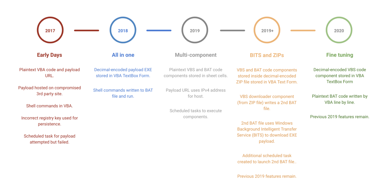
Figure 2. Evolution of delivery payloads

Despite the evolution over the years, some habits are hard to break. Firstly, every weaponized XLS Unit 42 has investigated loads a fake error message, such as the one shown in Figure 3 below, to trick the victim into thinking that the file is corrupt and thus nothing has — or will — load as intended. Another fictitious error message text has been used in the past often with poor spelling or grammar.