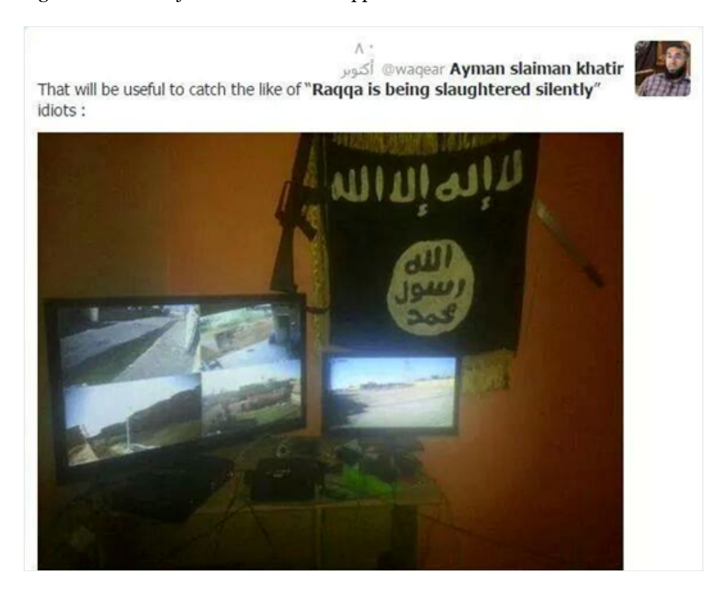
Image 1: Example of an online threat made against RSS. The image, which cannot be confirmed, purports to show CCTV installed around Raggah.

the group has been targeted for kidnappings, house raids, and at least one alleged targeted killing. At the time of writing, ISIS is allegedly holding several citizen journalists in Ar-Raqqah.