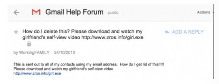
Figure 6. Screenshot of request on Gmail help forums related to "self-view" video e-mails.

Finally, we located a user who posted to the Gmail Help forum in 2010 requesting assistance with ridding their system of malware. He states that all of his contacts received one of the "self-view" phishing e-mails after his system was compromised.