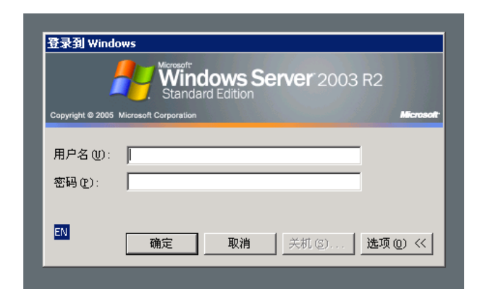
Figure 2. Chinese language Windows Server 2003 login banner on Gh0st C2

The infrastructure used in Musical Chairs stands out primarily due to its longevity and use of multiple Gh0st command servers on the same host. At the center of the infrastructure for the last two years is a Windows 2003 server using the IP address 98.126.67.114. The server uses a US-based IP address, but displays a Chinese language interface for Remote Desktop connections.