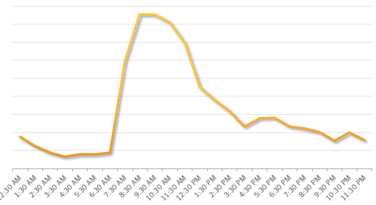
Figure 3. Cadelle and Chafer's activity levels by hour in Iran's time zone (UTC +3.5)

There are a number of factors in these groups' campaigns that suggests that the attackers may be based in Iran. Cadelle and Chafer are most active during the day time within Iran's time zone and primarily operate during Iran's business week (Saturday through Thursday).