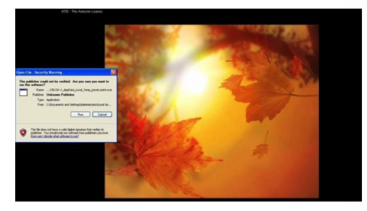
Figure 2 User tricked into running embedded SFX EXE

Figure 1 PowerPoint page mimics a paused video