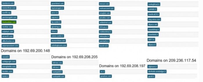
Figure 9 Neighbor IP addresses with Iranian domains

Domains on 85.158.203.190 Domains on 192.69.200.141 Domains on 209.236.117.69 Domains on 209.236.117.53