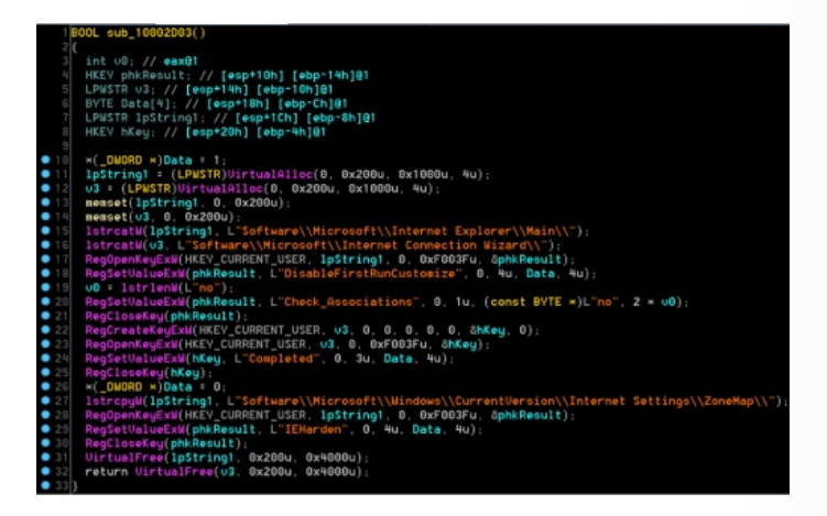
Figure 2. Routine to modify the IEHarden Value linking TidePool to BS2005.

Below is the routine within TidePool that modifies the IEHarden registry settings. The repetition, order, and uniqueness of the code base in this function allowed us to link TidePool back to older versions of BS2005 and Operation Ke3chang.