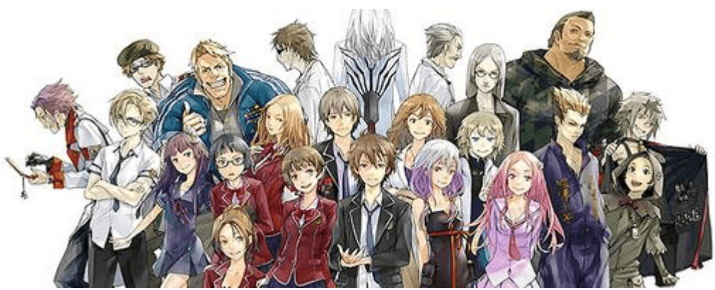
Figure 10. Main characters of Guilty Crown with Shu Ouma in the middle.