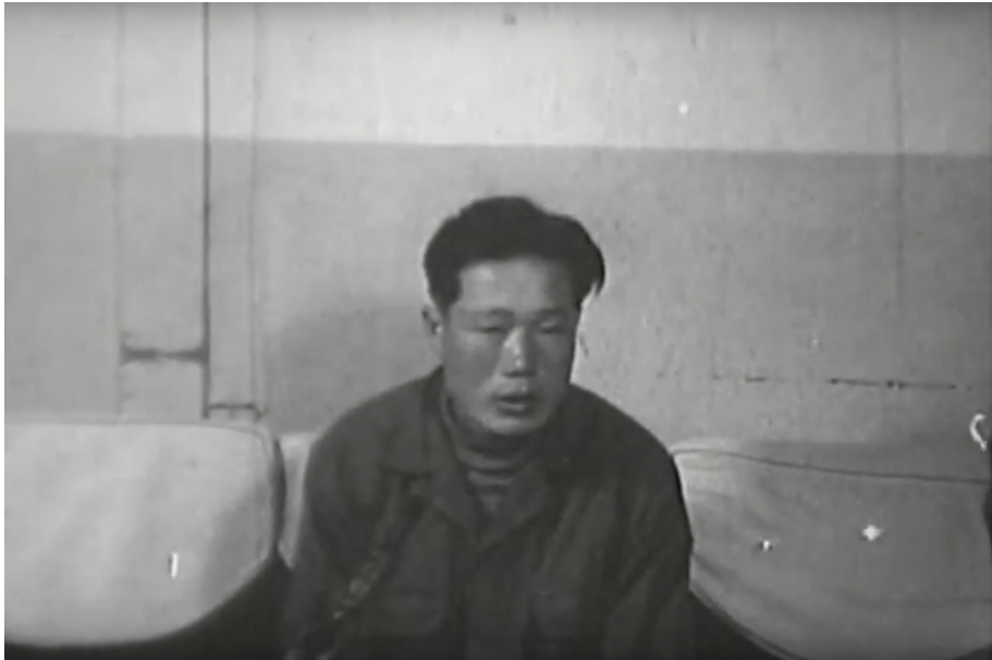
A captured North Korean soldier after the Blue House Raid.

meeting in 1972 between a South Korean intelligence official and the then-Premier Kim Il-sung. Kim claimed his government had nothing to do with the raid and “did not even know about it at the time.”