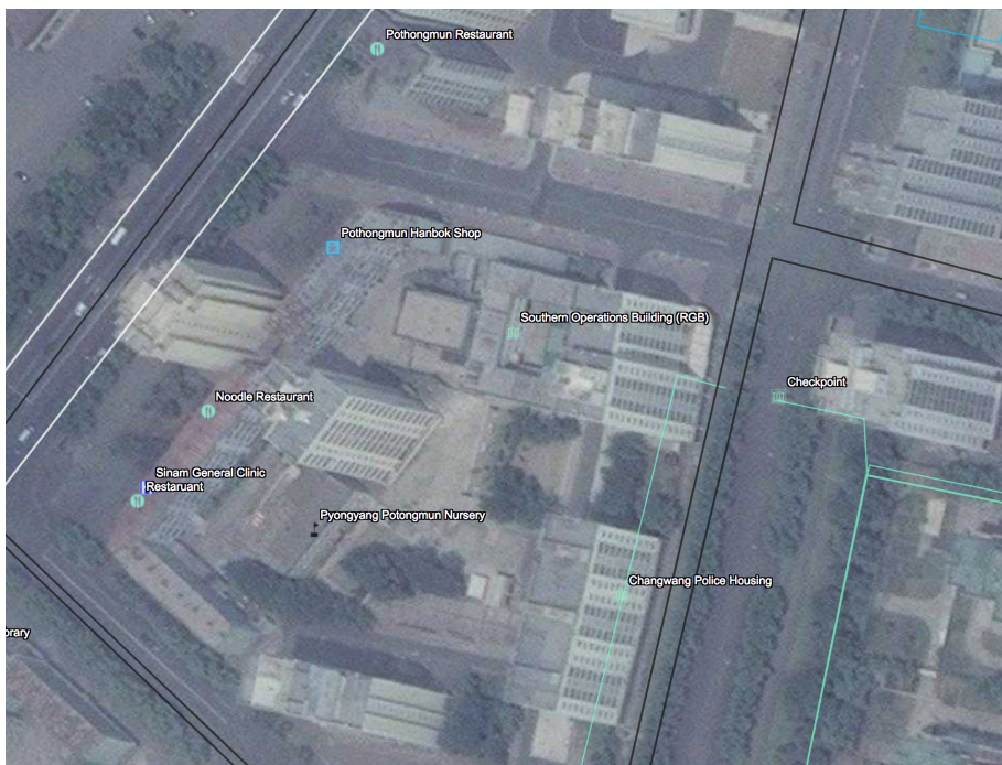
Satellite Image of the RGB Southern Operations Building in Pyongyang.

intelligence elements. Subordinate to the KPA, it has since emerged as not just the dominant North Korean foreign intelligence service , but also the center for clandestine operations . The RGB and its predecessor organizations are believed responsible for a series of bombings, assassination attempts, hijackings, and kidnappings commencing in the late 1950s, as well as a litany of criminal activities, including drug smuggling and manufacturing, counterfeiting, destructive cyber attacks, and more.