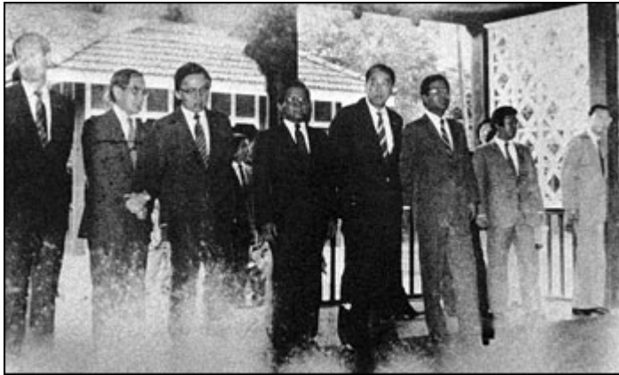
South Korean officials wait at the mausoleum in Rangoon minutes before the bomb detonated.