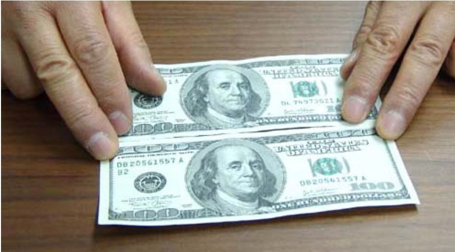
"Supernote" and a real $100 bill.

Distribution and production of the supernotes followed a similar pattern to North Korean-produced narcotics, utilizing global criminal syndicates , state and intelligence officials , and legitimate businesses . North Korea has repeatedly denied involvement in counterfeiting or any illegal operations.