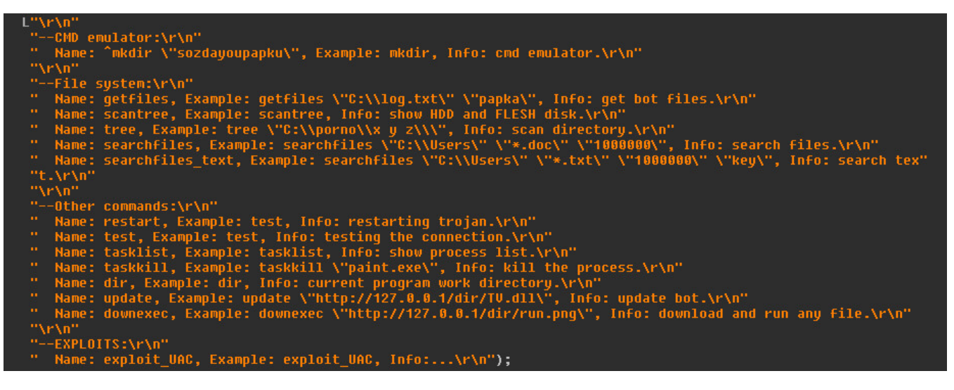
Fig 9: Help commands found in malicious DLL