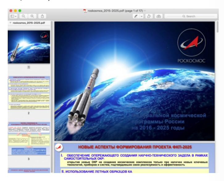
Figure 2 Decoy document opened by Komplex binder showing document regarding the Russian Space Program

contents of the decoy document, we believe that the target is likely associated with the aerospace industry.