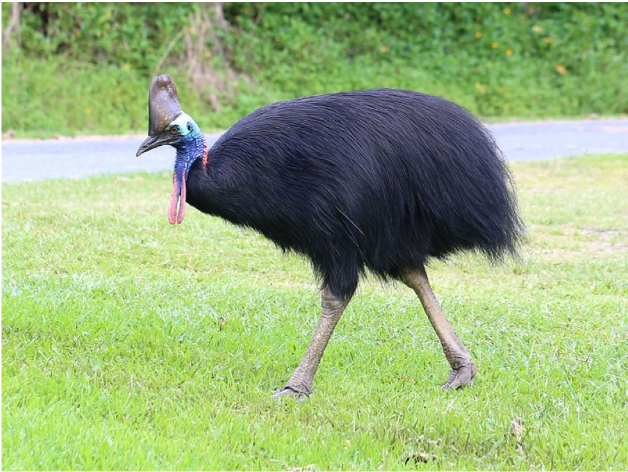
Figure 1 Cassowary

After initial setup, the method at the main entry point of the malware, as seen in Figure 2 may follow one of four main paths of execution. The main entry point contains a relatively simple set of if statements that determine the execution path of the malware. Interestingly, one of the paths appears to be for execution on a Mac or Unix host.