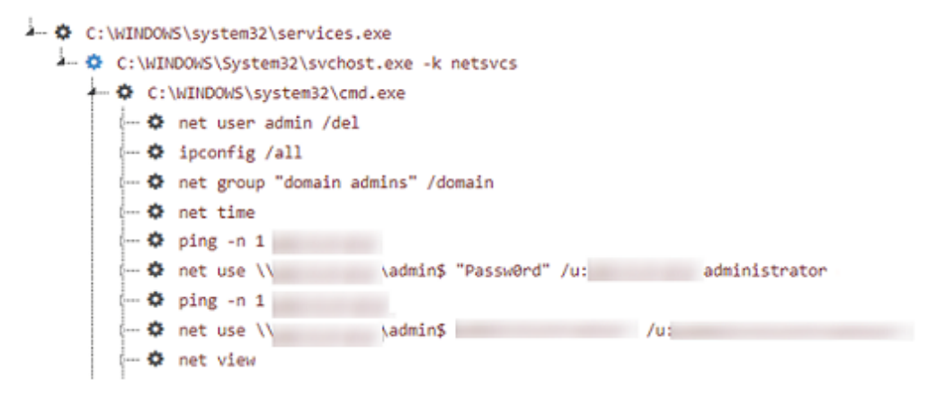
Figure 1. BRONZE UNION threat actor session.