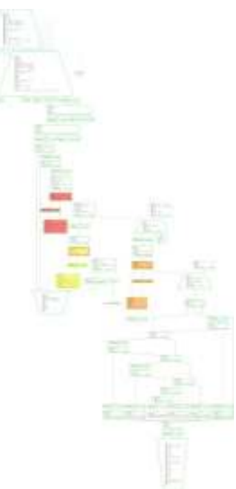
FIGURE 1 - BASE64 AND XOR ENCRYPTION SCHEME

The above screenshot illustrates a REcon(tm) trace on the malware dropper and subsequent service creation. Location A. represents the dropper program, which unpacks itself and decompresses a file to the system32 directory. Point B. represents the initial svchost.exe startup, which is loading the malware payload. Location C. is the actual execution of the malware service, which remains persistent. At points E. and F. you can see the malware checking in with the command and control server. Finally, location D. represents the dissolvable batch file which deletes the initial dropper and then itself.