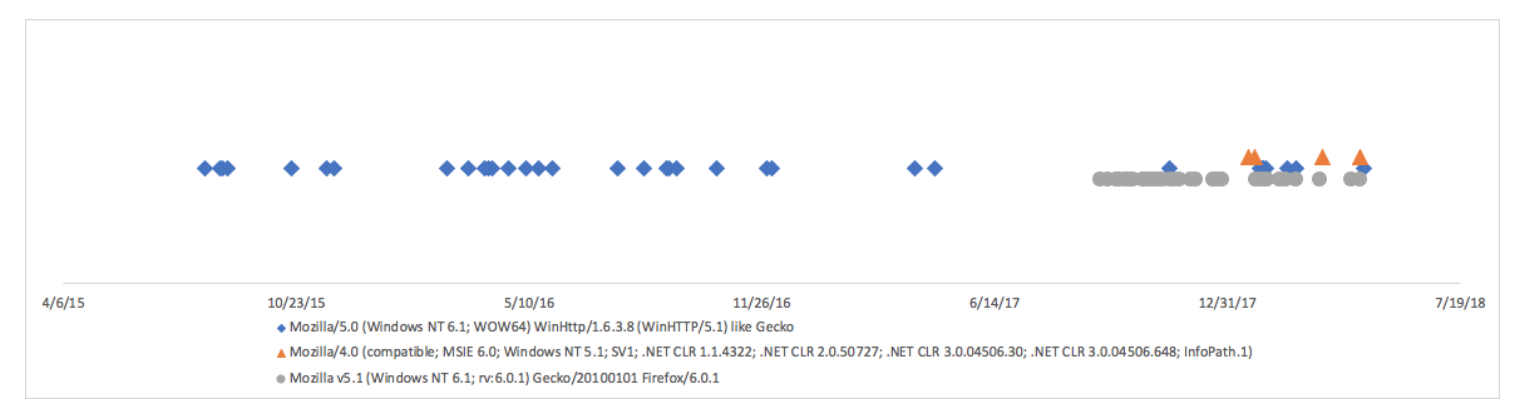
Figure 2 Timeline of User Agents

Examining the use of the unique user agents' strings over time shows that while previously only the Mozilla/5.0 user agent was in use, since mid 2017 all three user agent strings have been used by the Zebrocy tool for its C2 communications.