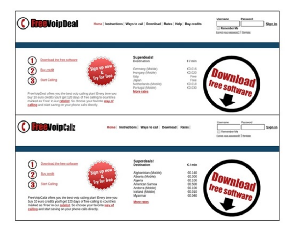
Figure 1. Original (top) and modified (bottom) website

Another sample website involved the use of a closely copied version of an existing website, with slight changes in the logo and options above the page. The download links were also replaced to download the malicious Android application instead.