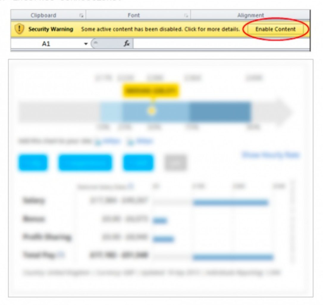
Figure 1. An example of the type of warning displayed by the lure document

This is a protected dynamic document, enable content to continue reading and authorise the content. This may take a few moments on slower internet connections.