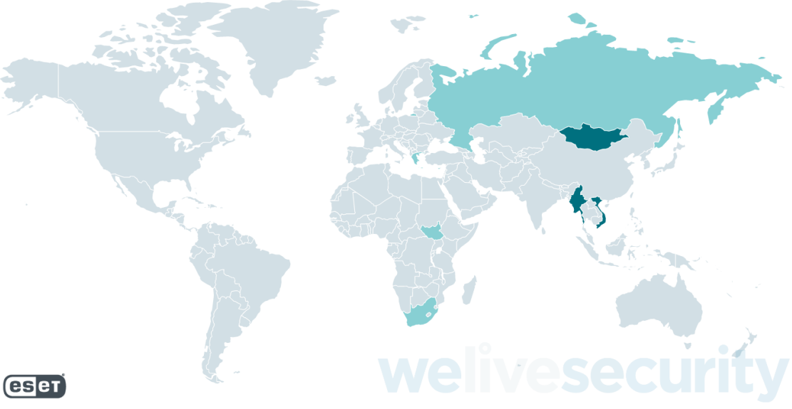
Figure 1. Countries affected by Mustang Panda in this campaign

Other phishing lures mention updated COVID-19 travel restrictions, an approved regional aid map for Greece, and a Regulation of the European Parliament and of the Council. The last one is a real document available on the European Council's website. This shows that the APT group behind this campaign is following current affairs and is able to successfully and swiftly react to them.