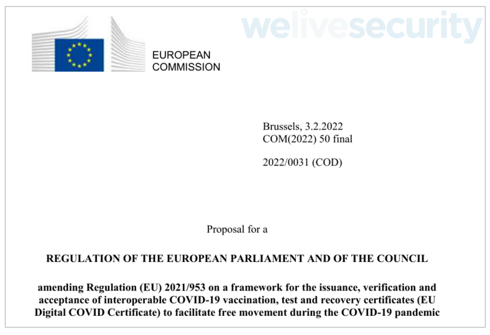
Figure 3. First page of the decoy document for the REGULATION OF THE EUROPEAN PARLIAMENT AND OF THE COUNCIL.exe downloader. It's a real document available on the European Council's website.