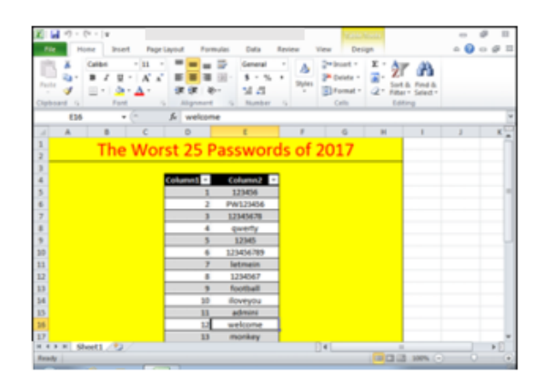
Figure 3. Phishing decoys used in 2018 LYCEUM campaign. The malicious Excel files dropped DanBot variants.