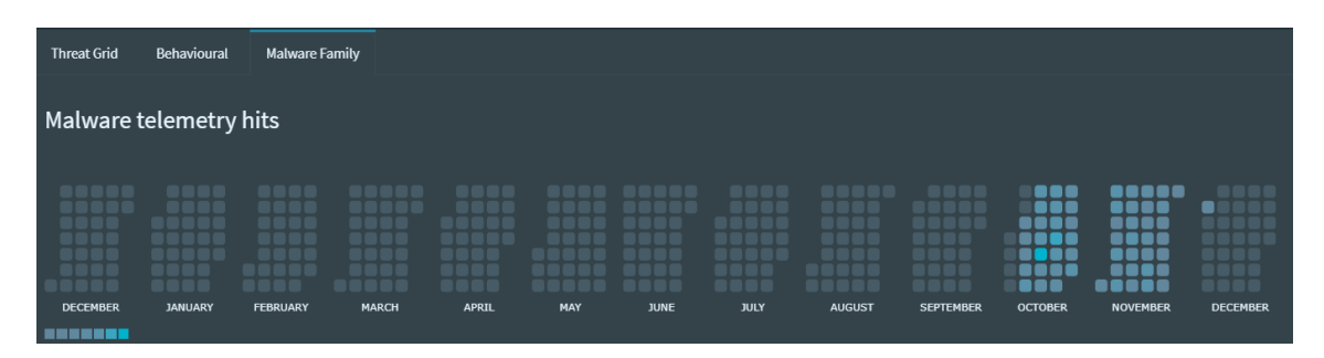
Telsy Threat Intelligence SecOps Platform

This signature made it possible to obtain a good level of detection with a low false positive rate. As the image below reports, starting from the second week of October 2020, the group began to heavily spread "OriginLogger plus Cassandra" payloads, internally reaching a number of unique detections exceeding the 500 hits from mid-October until dropping around only 10 to December 1, 2020 (this is probably as a consequence of the increase in the global detection rates of the variants in question).