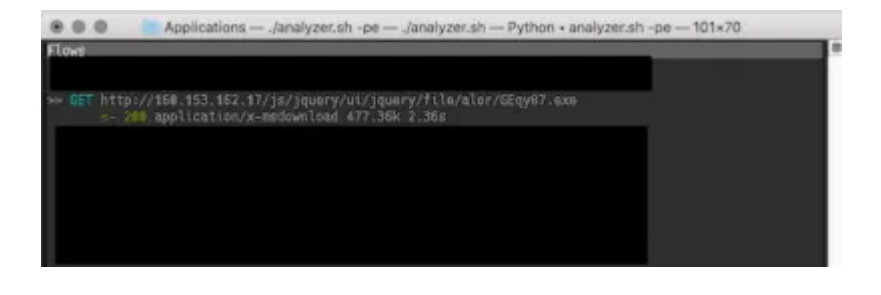
Introducing Stage4. PE file droppend and executed

Evidence of what dissected is shown on the following image (Introducing Stage4) where the EquationEditor network trace is provided. We are introducing a new stage: the Stage4. GEqy87.exe (Stage4) is a common windows PE. It's placed inside an unconventional folder ( js/jquery/file/... ) into a compromised and thematic website. This placement usually have a duplice target: (a) old school or un-configured IDS bypassing (b) hiding malicious software into well-known and trusted folder structure in order to persist over website upgrades.