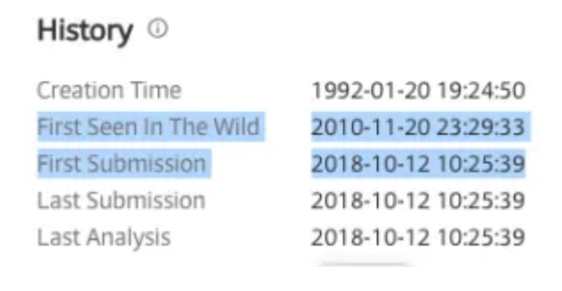
Stage4: According to Virus Total

Looking into GEqy87 is quite clear that the sample was hiding an additional windows PE. On one hand it builds up the new PE directly on memory by running decryption loops (not reversed here). On the other hand it fires up 0xEIP to preallocated memory section in order to reach new available code section.