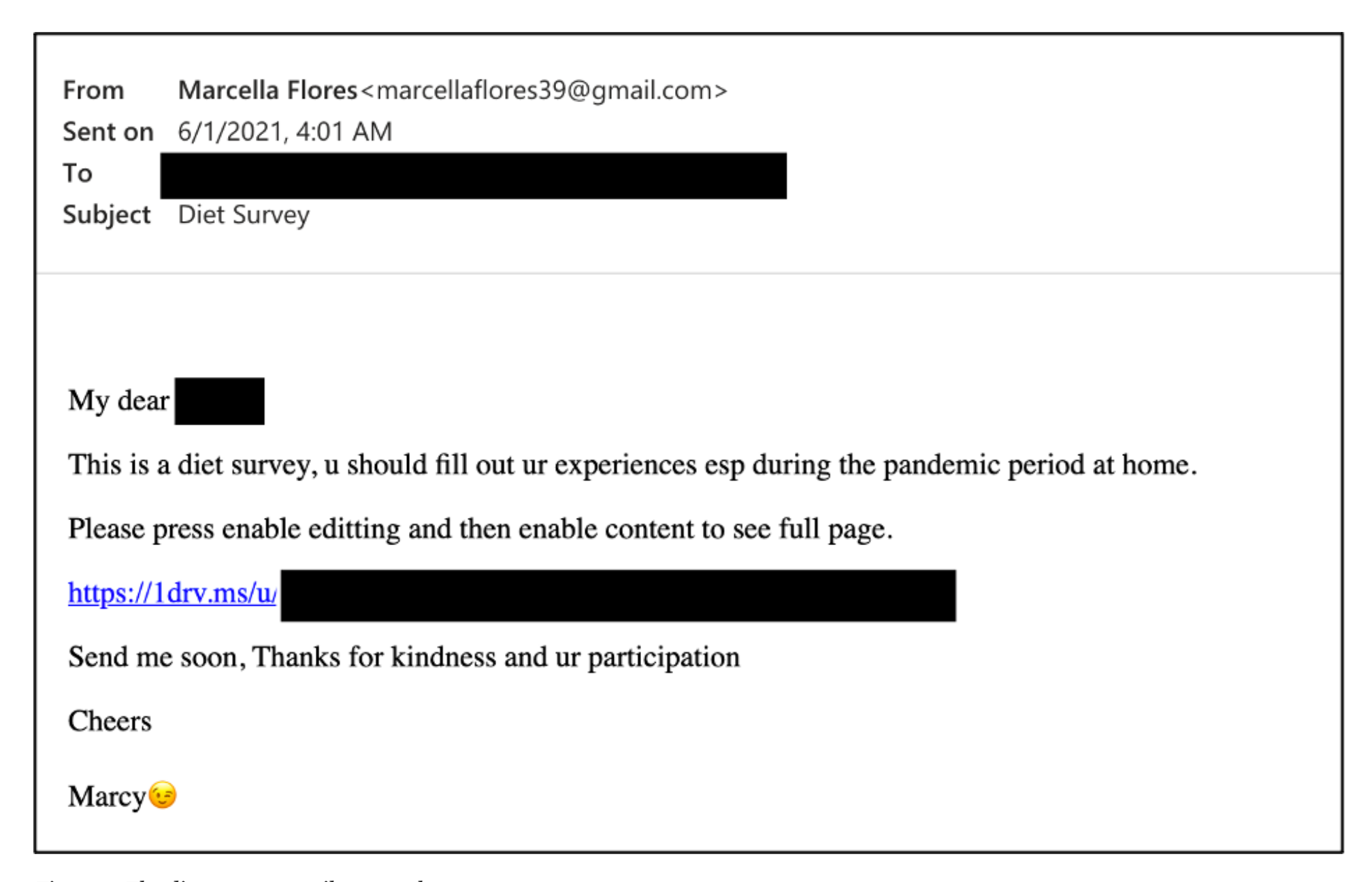
Figure 1. The diet survey email sent to the target.