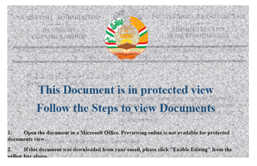
Figure 2. A sample document used in the campaign. Note that it uses the Tajikistan emblem, signifying that this is likely used to target government organizations or make it seem that it came from one

Some examples of the lure documents used in the campaign can be seen below: