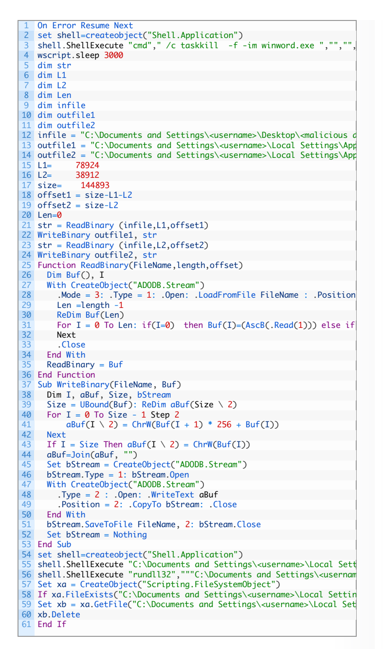
Figure 5 VBScript within ss.vbs responsible for extracting and running the payload and decoy