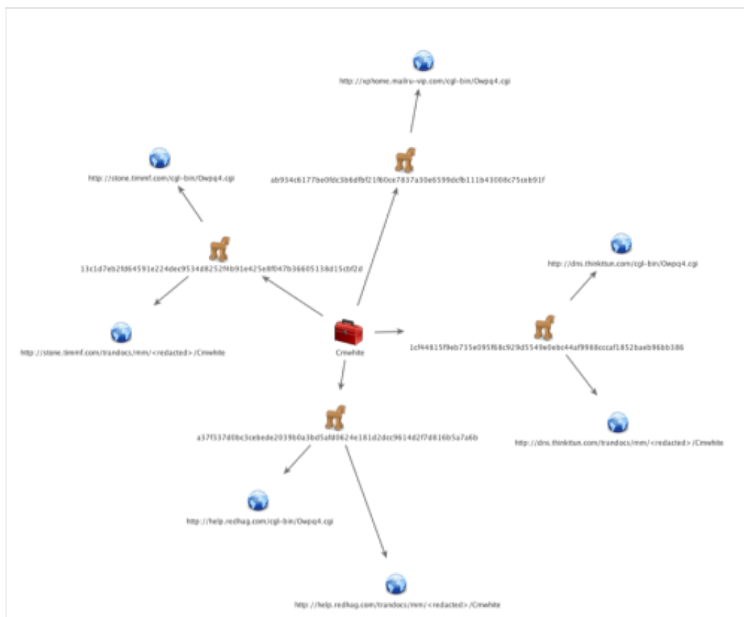
Figure 2. Cmwhite Tools Using “cgl-bin” within HTTP Requests

It should be noted that the C2 URL contains the string ‘cgl-bin’, which visually resembles the common cgi-bin folder used by many web servers to run server-side scripts. Unit 42 used the Palo Alto Networks AutoFocus threat intelligence service to locate additional samples using the ‘cgl-bin’ string within URLs of HTTP requests and found several samples of the Cmwhite tool associated with the LURID/Enfal downloader 1 , as seen in Figure 2.