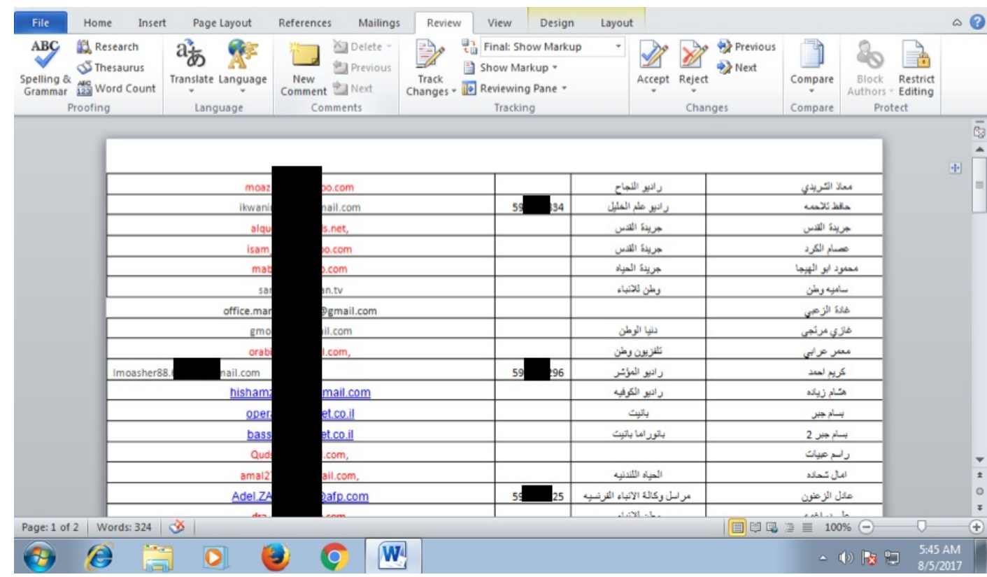
Translation: Contacts list of media personnel