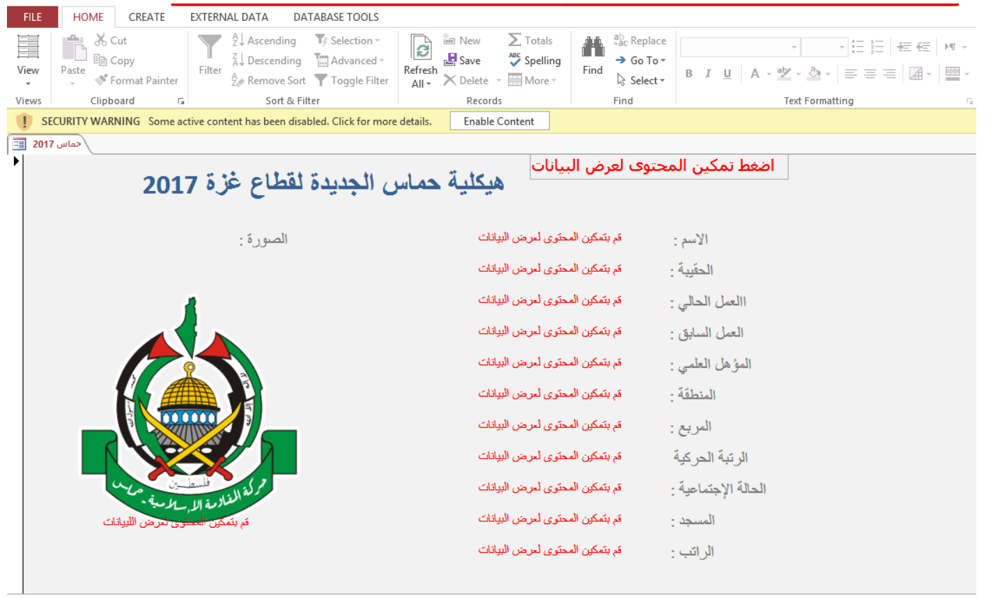
Translation: The new Hamas structure for Gaza strip 2017