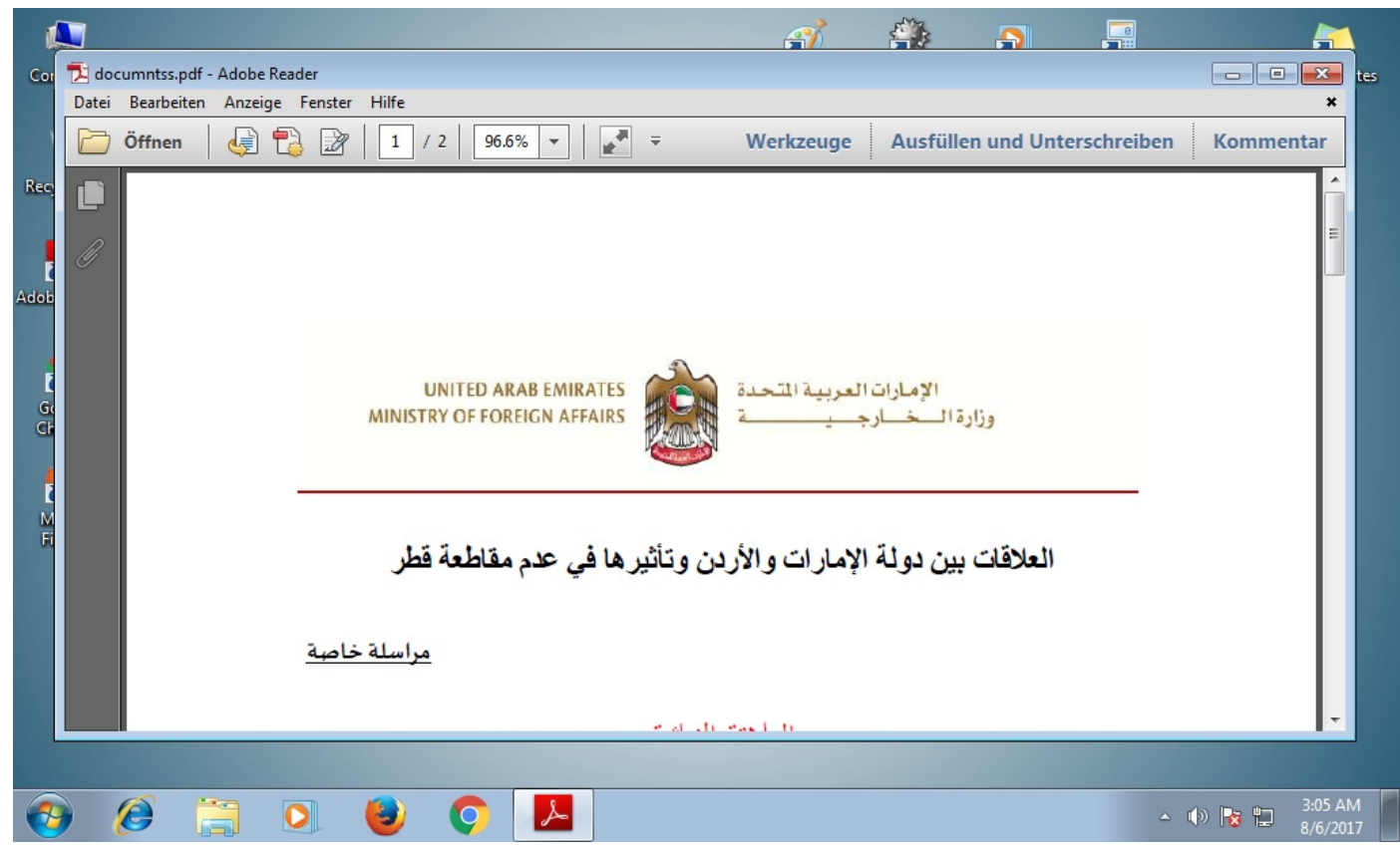
Translation: Relations between UAE and Jordan, and the impact caused by the non-boycott of Qatar