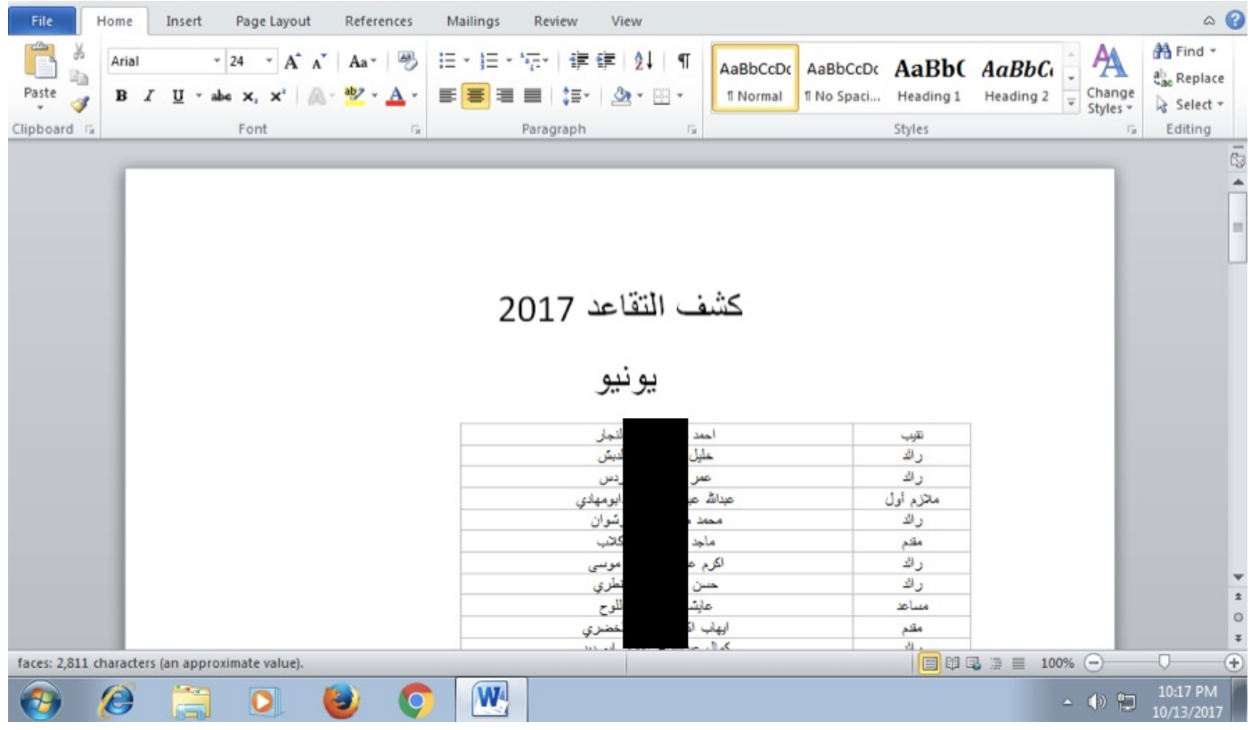
Translation: Military retirement statement 2017 June