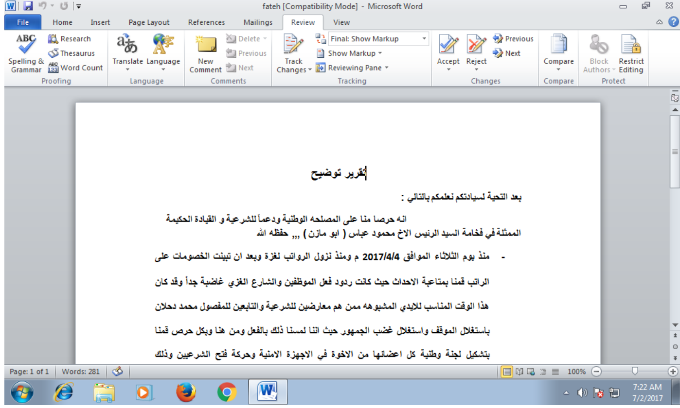
Translation: Clarification report (on Gaza employee salaries)